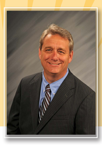
.....8 U YMcgh Auditor of State