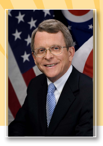
<sup>..</sup>A __ Y8 ¥K ]bY Attorney General